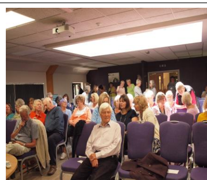
The audience awaits.....