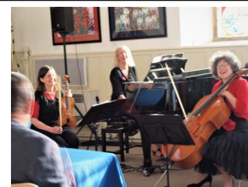
Trio Paradis – Wrap – Up Tango Concert