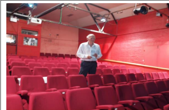
Sir Vince Cable, waiting for his SOLD OUT audience to arrive! – How to be a Politician.